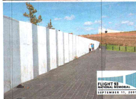
FLIGHT 93 NATIONAL MEMORIAL SEPTEMBER 11, 2001