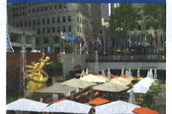
Explore amazing Rockefeller Center