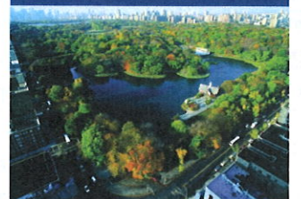
Visit famous Central Park