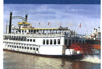
Enjoy a Riverboat Cruise